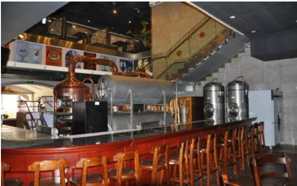
Inside view of Tsingtao Brew Pub in Solana, Beijing