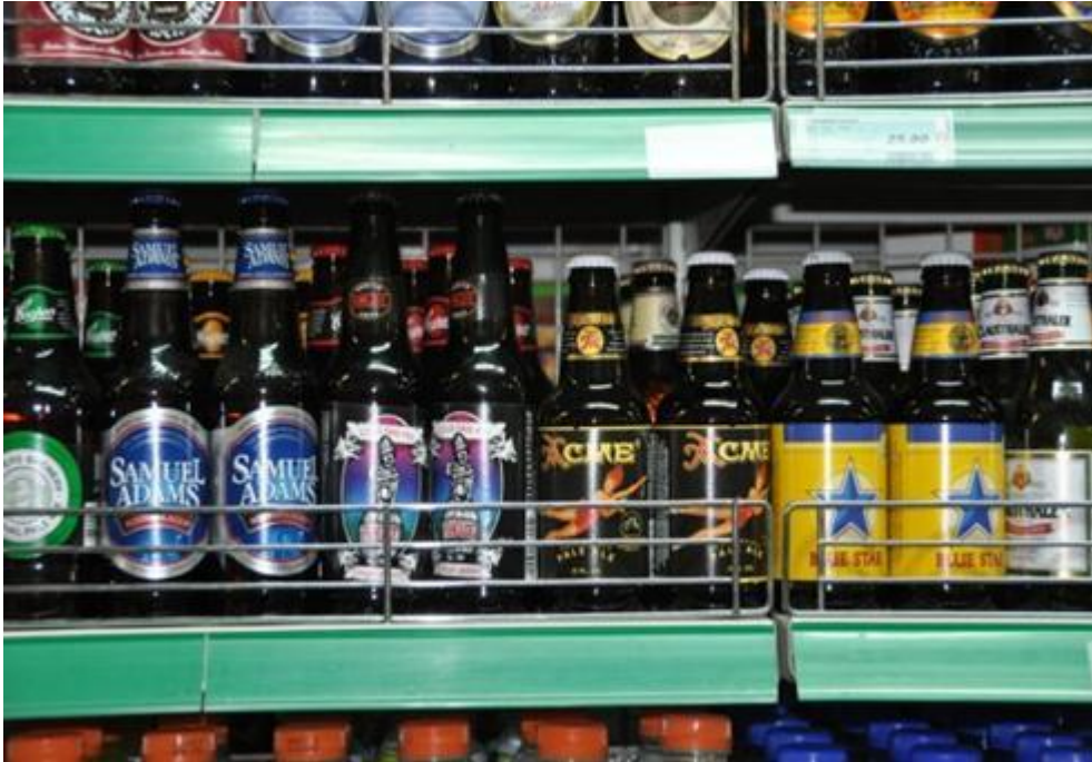
Rogue Dead Guy sold in supermarket