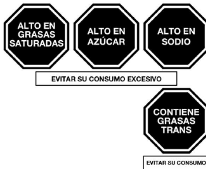
Gráfico 1: Advertencias publicitarias

Advertising warnings should be clear, legible, prominent, and understandable. The label should be placed on the front side of the product's packaging, according to the following specifications and details included in Annex 1 of the Warning Label Manual :