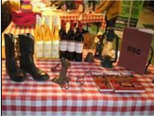
Great American BBQ