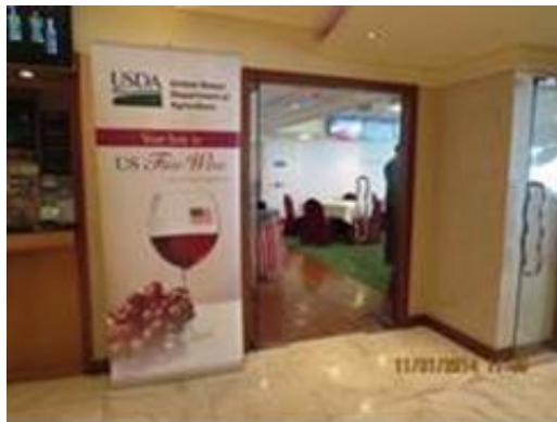
U.S. Wine Fair at Hong Kong Jockey Club