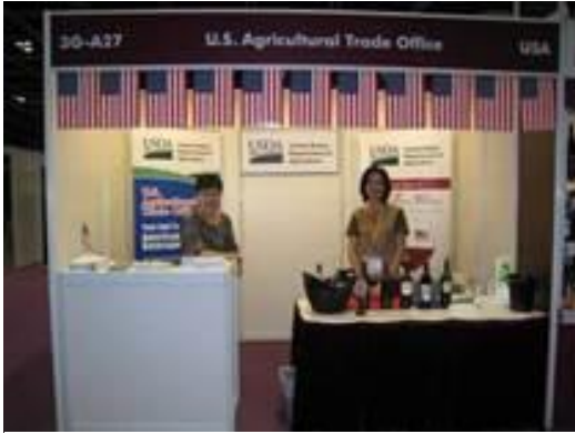
Hong Kong Int'l Wine & Spirits Fair