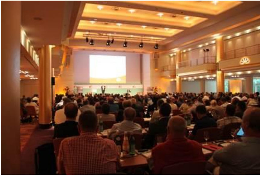
More than 300 participants were eager to learn about crop prospects for 2016

All forecast are based on information available in mid-July.