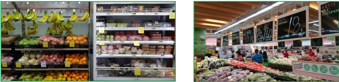
Mini mart in a suburban area where residents live (left) and big format store in “HDB Hub” where there is a bus interchange and MRT (right).

supermarkets and hypermarkets in particular. Such stores offer one-stop shopping for consumers; a clean, comfortable, and air-conditioned environment extended opening hours as well as loyalty programs and weekly promotional offerings.