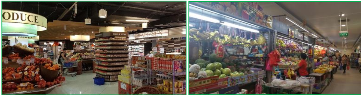
Paragon Market Place located in prime Orchard Road Shopping district (left) and fruit stalls in a typical “wet market” in suburban district (right).

However, there is still a small group of regular or loyal homemakers and elderly who perceive food products from wet markets as fresher than products from supermarkets. Some believe that bargaining for lower prices in wet markets could land them with better deals than the latter.