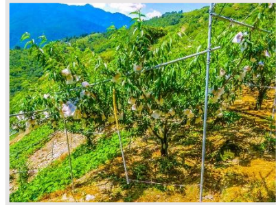
Local Production of Honey Peaches