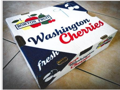
Local Imports of Washington Rainier Cherries