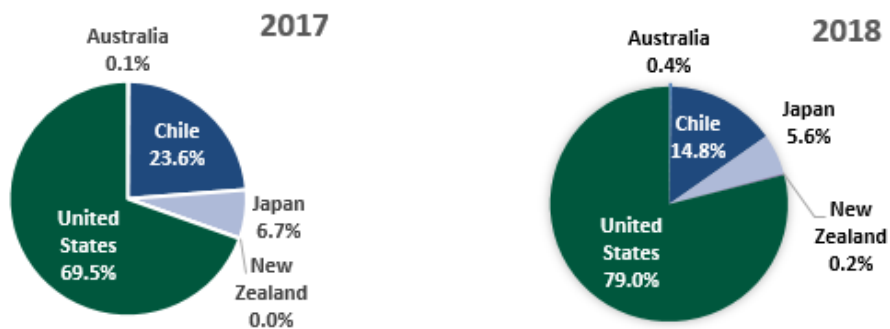
Peach & Nectarine Import Market Share

Chile predominately supplies Taiwan during the U.S. off-season, however due to severe hail storms and declining production in 2018, Chilean market share decreased by 15 percent. Chilean production issues combined with good conditions in the Western United States caused U.S. peach imports to jump 12 percent to 10,856 MT. In 2018, the United States dominated with 79 percent of the peach and nectarine import market.